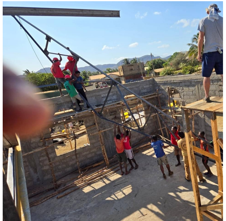
About 20 guys lifted each 1,000 pound truss into place. 7 trusses total