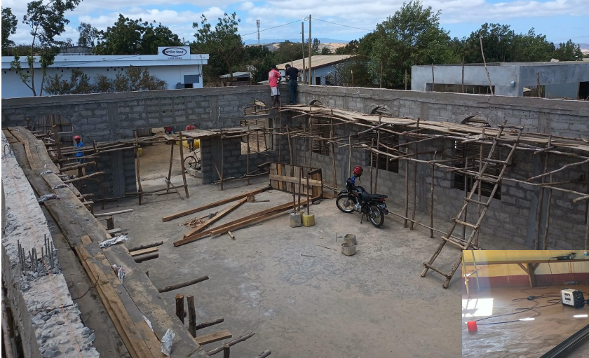
Attaching metal plates to top of walls to receive trusses.